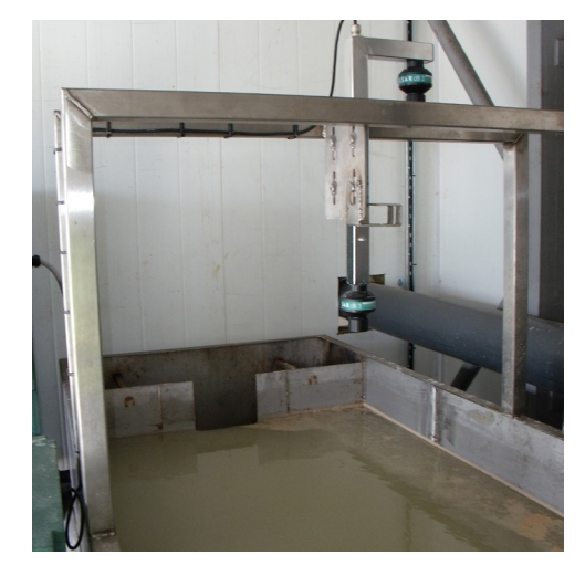
DUET Transducers Monitoring Plant Effluent

Pulsar's DUET non-contacting, ultrasonic transducer array, together with the matching FlowCERT controller was chosen for this project. Ultrasonic systems work by bouncing a sound pulse from the surface being measured and calculating the distance from the time taken for the pulse to return to the transducer. The accuracy of the measurement depends on the speed of sound, which can vary with temperature. Temperature changes can be compensated for, but a temperature compensation circuit can't respond immediately and there may be temperature variations in the column of air below the transducer face.