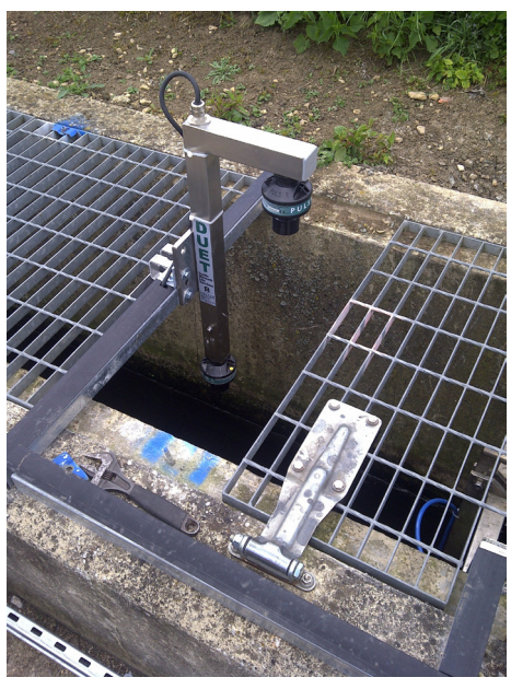
DUET Transducer in a Wastewater Application