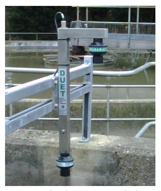
DUET Transducer in a Wastewater Application