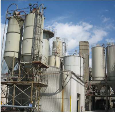
An example of silo level measurement.