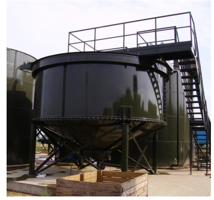
Liquid Tank Level Monitoring