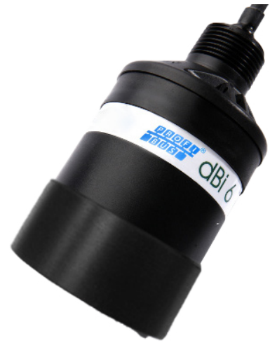
dB i 6 Profibus PA Transducer with Submergence Shield.

dB i Profibus PA Transducers operate on the principle of timing and the echo received from a measured pulse of sound transmitted in air and utilize state of the art echo extraction technology.