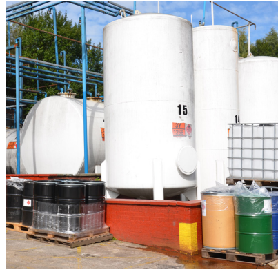
An example of tank level measurement.